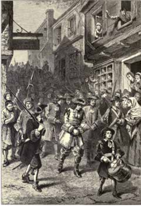
“Andros a Prisoner in Boston” illustrated by F.O.C. Darley, William L. Shepard or Granville Perkins, 1876.

England and North America during this era, therefore, it is reasonable to assume that Mary ’s crew dressed in this manner as well.