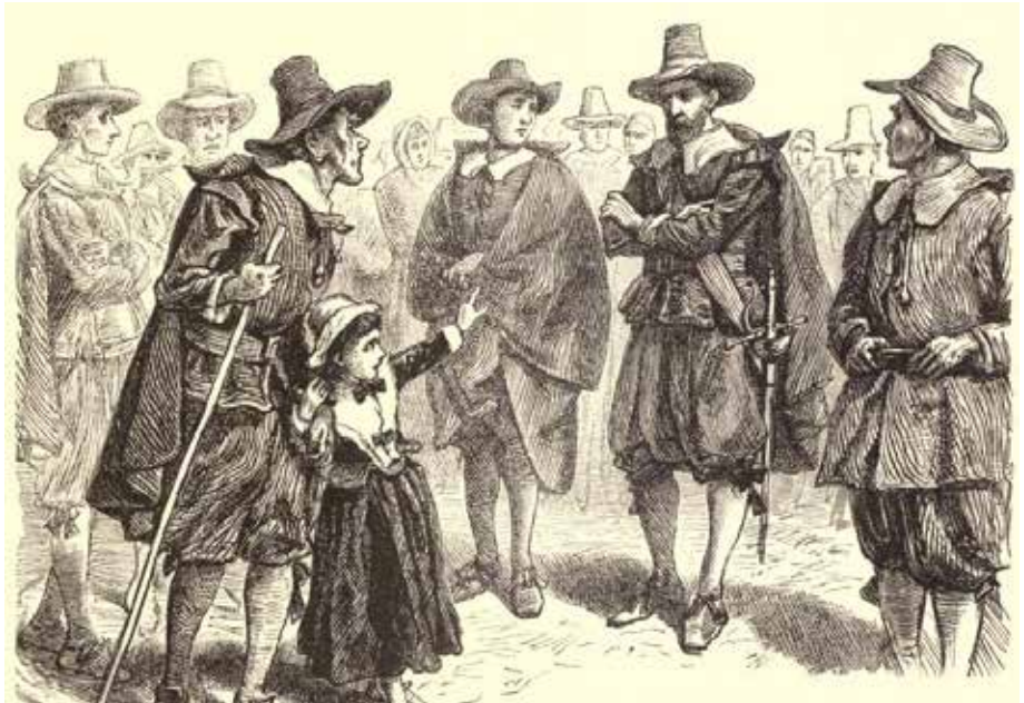
"Captain Alden Denounced." Depiction of Capt. John Alden, Jr. denounced as a witch during the Salem Witch Trials. (Bryant and Gay, A Popular History of the United States , 1878)