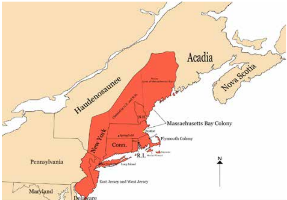
The Dominion of New England.