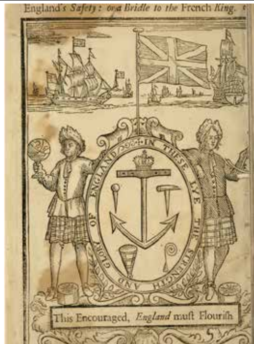
A period piece shows how Mary ’s crew may have been dressed.