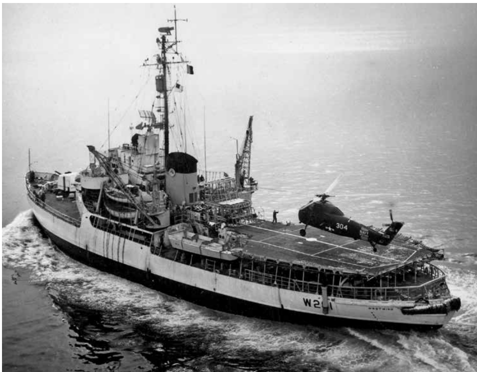
Image 3: A US Navy New York Naval Air Reserve Sikorsky HSS-1 Seabat landing on the deck of the US Coast Guard icebreaker Westwind operating off the east coast of the United States in 1961.

would eventually lead to the Antarctic Treaty (which essentially froze territorial claims) had already begun by the time Magnuson’s nuclear icebreaker bill was up for debate, yet he maintained that “everybody is in there, everybody is going to try to establish sovereignty.” 67 With a nuclear icebreaker, the US could support American territorial rights across the continent – particularly to the unclaimed and inaccessible Marie Byrd Land with its ice-clad coastline. 68