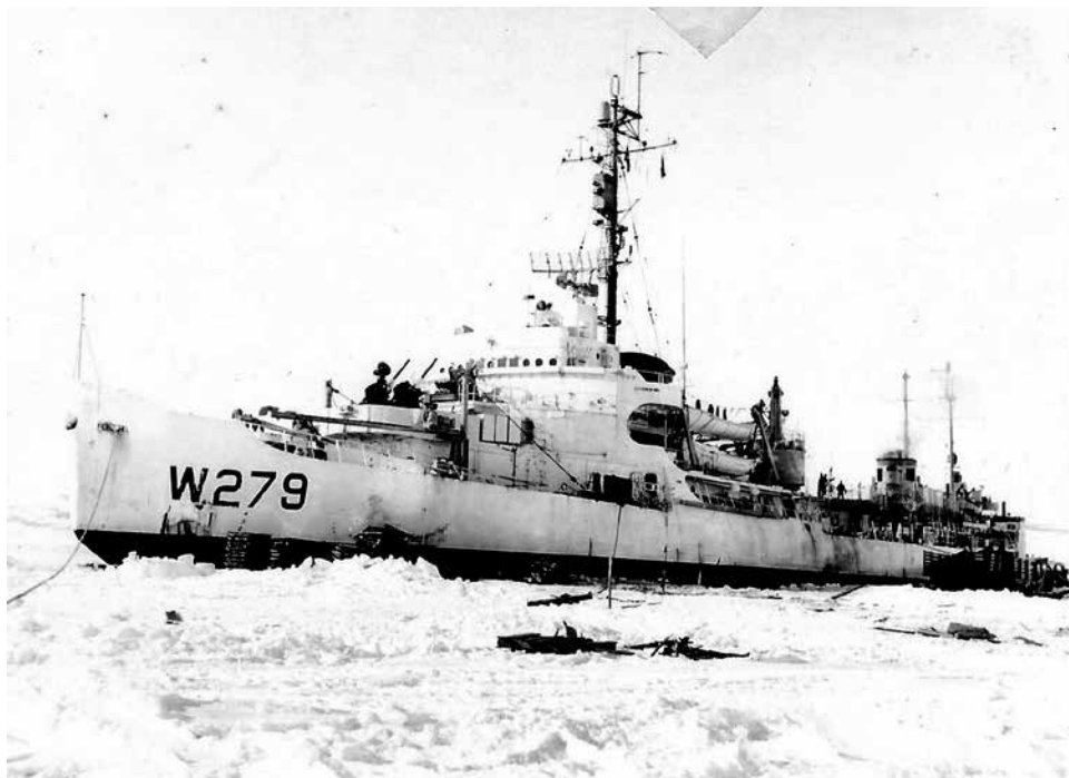
Image 1. The US Coast Guard icebreaker Eastwind in the ice, 1955.

Meanwhile, in the Antarctic, USS Atka performed an expeditionary cruise in 1954-1955 evaluating sites for the science stations the US planned to establish during the International Geophysical Year (1957-1958). As part of the country’s growing interest in the polar regions, the US Navy constructed Glacier , which had superior ice-breaking capability, cargo capacity, science facilities, and endurance than the Wind-class vessels. 33 In 1955-1956, Glacier , Edisto , and Eastwind escorted five other vessels to the Antarctic during Operation Deep Freeze I, which brought equipment, materials, and supplies for the upcoming IGY and constructed four