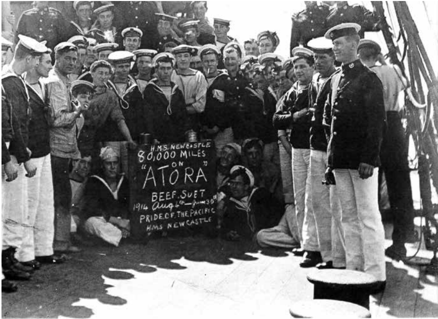
Brand Promotion 1914: Crew members of HMS Newcastle including Royal Marines (figures on right & in background) posing with sign Advertising "ATORA" brand beef suet. Newcastle arrived in Esquimalt in August from the China Station and remained in the eastern Pacific for two years.