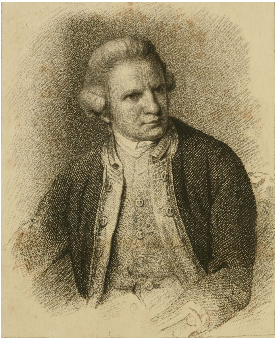
Captain James Cook, from the frontispiece of The three voyages of Captain James Cook round the world (1821)

Becoming a master in the Royal Navy had been a remarkable achievement. It was probably as high a rank as James Cook would have expected to reach in his naval career. The master played an essential role in a warship. He was responsible for the ship's navigation—setting courses, determining the ship's position, supervising pilotage—and he supervised the young midshipmen in learning the fundamentals of navigation themselves. He was responsible for stowing the ship's