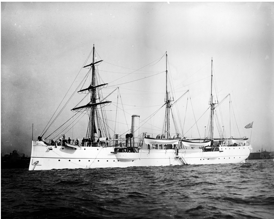
USS Petrel , Gunboat No. 2, 4th-rate gunboat commissioned in 1899.

necessity, given the limited naval forces the United States had at hand, Taylor observed, “our fleet will waste away under this system and presently be eliminated.” In response to this inevitability, he outlined a plan for constructing additional warships after an outbreak of war. He envisioned building some fifty or sixty ships of from 2,500 to 3,000 tons, having armament powerful enough to penetrate battleships at close range and armour sufficient to withstand all but the heaviest guns. They were to be designed for speed and with coal capacity for operating at short ranges. He proposed having blueprints and building supplies prepositioned in protected shipyards along the East Coast so that in seventy-five days, while the existing fleet delayed the enemy, the new fleet would be ready to attack it. 17