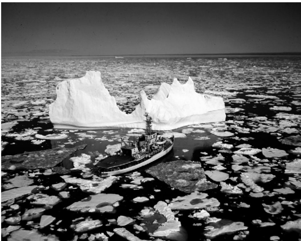
HMCS Labrador alongside iceberg

growing and became known to many outside his small circle of Arctic veterans. In April 1952, he was asked to present the naval aspects of Arctic combat at the United Services Institute conference in Montreal. 31 Then, in August 1953, he was brought to headquarters in Ottawa as the staff officer (Arctic) as the RCN began to prepare for a more concentrated venture into Arctic operations. His work included coordinating the maiden voyage of the navy’s new icebreaker, HMCS Labrador , nearing completion at the shipyard in Sorel. 32