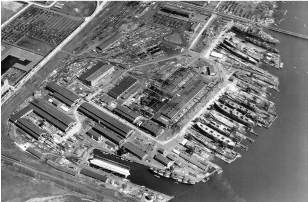
Illustration 2: Federal Shipbuilding in Kearny, New Jersey.

The election of President Roosevelt certainly benefited the shipyard. In 1933, the shipyard received contracts to build Mahan class destroyers using funds made available through Roosevelt's National Industrial Recovery Act. A year later, the Navy used funds appropriated through the Vinson-Trammell Act of 1934 to contract for the heavy destroyer USS Somers . As these ships joined the fleet, the shipyard won additional contracts. By 1936, some 3,000 workers fabricated new merchant ships and the yard earned contracts to build Navy destroyers. With its expanding work force, Federal Shipbuilding earned kudos for building ships quickly and efficiently. 5