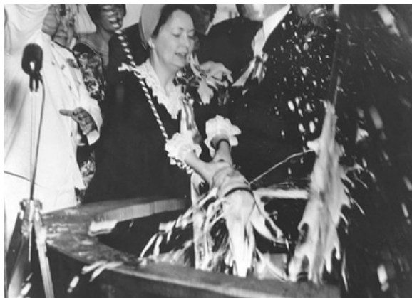
Illustration 6: Margaret Mitchell, author of Gone With The Wind, the sponsor of the ship.

wore “a black crepe dress with white lace collars and cuffs, black flat-heeled shoes and black silk stockings” along with “a pink, off-the-face hat, and a diamond ring, a wrist watch and pearl earrings.” The author then grasped the bottle of champagne “much as she would have held a baseball bat” and “cracked it squarely and neatly against the ship’s knife like prow, spattering most of the frothy contents well over the hard steel.”