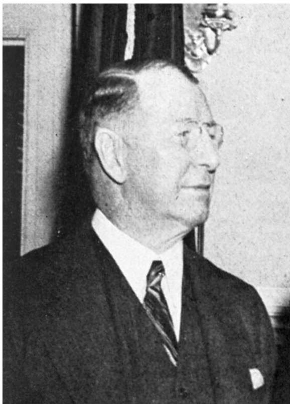
Illustration 3: Frank Knox (1 January 1874 – 28 April 1944), Secretary of the Navy.