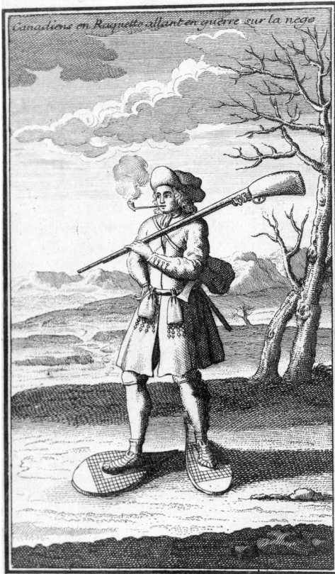
Illustration 2: A soldier of late 17 th Century New France wearing a tapabord hat, a justaucorps, culottes, or breeches and a gun in his hand. This image gives a good idea of how the pilot of La Salle's Griffon was dressed.

The eagerness that I have noticed up to now in certain people to engage me in pursuing the Pottawatomies as if they had looted and burned the barque that was lost in this lake, has always made me believe that there was some mystery hidden underneath. I have seen no indication that the Savages could have caused this boat to