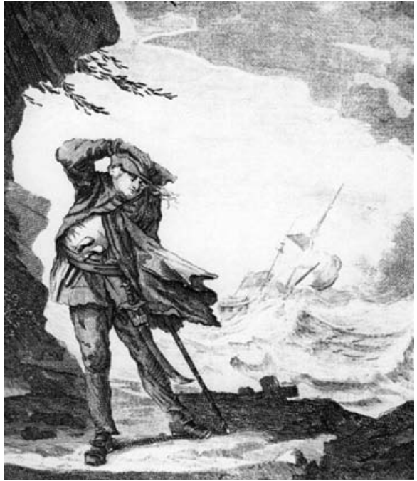
Illustration 6: Capl. EDWARD LOW in y e Hurricane which he and all the Crew had Like to perish from Capt. Charles Johnson, A General History, op. cit., 1734.