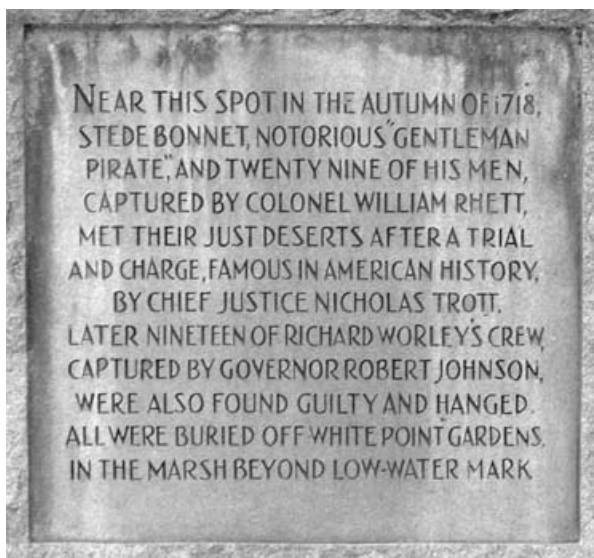
Illustration 4: Historical Marker Commemorating Pirate Executions, White Point Gardens, Charleston, South Carolina. Photographed by the author, 28 April 2011.

Captain Edward "Ned" Low enjoyed better success the next spring. Commanding the schooner Fancy , of eighty tons, ten guns, and eighty men, Low sailed in consort with the brigantine Ranger , commanded by Captain Charles Harris. Off the Carolina coast on 27 May, Low and Harris seized four vessels that had departed Charles Town two days previously: the ships Crown , King William , Carteret , and a brigantine.