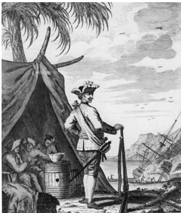
Illustration 5: Cap t . GEORGE LOWTHER and his Company at Port Mayo in the Gulph of Matique from Capt. Charles Johnson, A General History , op. cit. , 1734.

The pirates probably plundered these vessels and let them go because they were after other prizes a few days later. 26 By early June, Low and Harris had captured eight more vessels, including two brigantines bound for England from Carolina. The pirates experienced bad luck on 10 June when they mistook HMS Greyhound , commanded by Captain Peter Solgard, for a merchantman. After a long and bloody engagement, the Greyhound captured the Ranger , but Low escaped. He continued to seize numerous British, French, and Portuguese vessels, though apparently none involved in the Carolina trade. 27