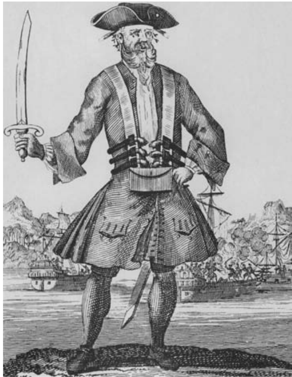
Illustration 1: Blackbeard the Pirate, as he appeared in the second edition of Capt. Charles Johnson, A General History of the Pyrates, from Their first Rise and Settlement in the Island of Providence, to the Present Time. ... The second Edition with considerable Additions. London: printed for, and sold by T. Warner, 1724.

Johnson was concerned about the difficulties of ending piracy in Carolina shipping lanes and elsewhere in America. He believed that King George’s policy of offering pirates amnesty had failed and contended that only force could eliminate piracy. He feared the situation would get worse because large numbers of pirates operated from New Providence. Johnson knew that London officials had appointed Captain Woodes Rogers governor of the Bahamas with the primary goal to eliminate piracy in what had become the pirates’ favorite haunt, but the South Carolina governor was worried. “A Sloope arrived here from [New] Providence about Six Days agoe but I cant learn Capt. Rogers Governr. of those Islands is yet arrived there [;] tis to be hoped he has Frigates with him & a good force of Land men otherwise he will be under Some resque of being Attact by Pyrats for it being their nest & rendezvous they will be