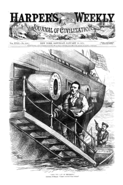
Harper's Weekly, 10 January 1874.

U.S. merchant fleet for a number of reasons. Ship builders, hoping for increased business, backed a Congressional prohibition on the re-registry under the U.S. flag of ships that had transferred to Britain, in effect blocking a post-war resurgence of American shipping. As British shipyards built steam-propelled iron freighters, shipyards in the United States could not compete in the cost of materials or labor. The long-distance trades of the United States made sail power seem more reliable than steam power that relied on ready supplies of coal, tending to retard U.S. technical progress in shipbuilding.