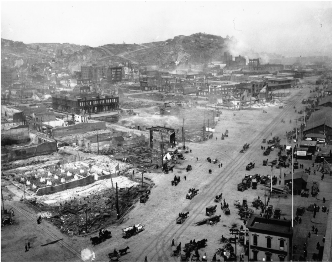
Fig 10: San Francisco, near the waterfront — Relief efforts began shortly after the fires were under control. Horse drawn carts are already unloading supplies even though some of the buildings are still smoldering.

Dodge and his men under naval orders continued distributing food and performing patrols along the waterfront at night. For at least a month they distributed food, meal tickets, and passes. They settled disputes, made sanitary inspections of the refugee camps, assisted persons looking for friends and relatives, and helped to maintain the 150 relief stations in the city. In addition, the Golden Gate's galley prepared hundreds of meals for the destitute. The cutters also brought food and fresh water into the city and patrolled the docks. Lieutenant Dodge paid an extreme compliment to the men under his command, writing that they showed great courage and had “worked day and night without complain of hunger or weariness, and obeyed orders . . . with cheerfulness and alacrity.” 31