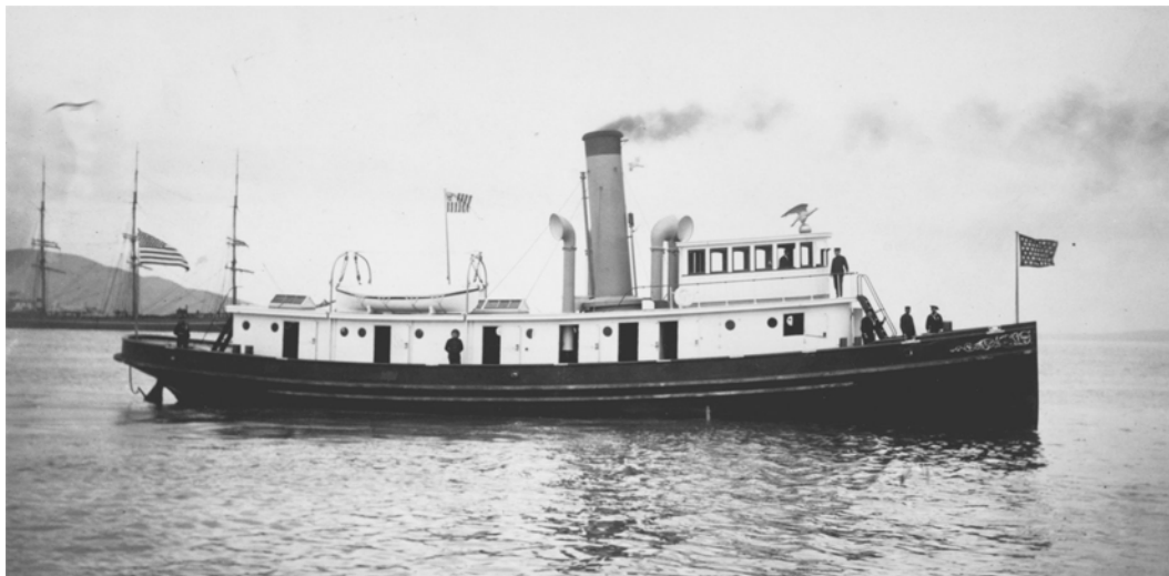
Fig 1: Golden Gate—The Golden Gate, a 110-foot tug, built in 1896, served an important role in the firefighting efforts along the waterfront after the earthquake. She remained in service until 1947.

increased the need for customs enforcement. When the United States acquired Alaska in 1867, the Service also needed a West Coast port to use as a base for its Bering Sea patrols. San Francisco served as the staging area for the cutters' annual journeys into Alaskan waters to enforce revenue laws and to protect the general interests of the United States.