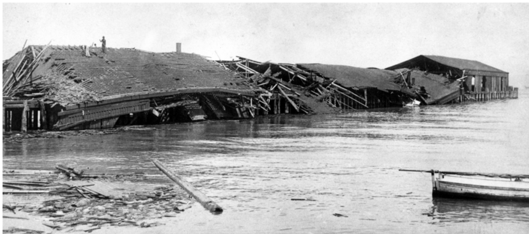
Fig 5: Damaged Wharf—The San Francisco waterfront was saved by the efforts of the Revenue Cutter Service, the US Navy and a few other craft. The preservation of the waterfront facilities aided the city's rebuilding and the landing of food and supplies for the destitute survivors. Pictured is one of the wharfs that did not survive.

The San Francisco Fire Department used nearly thirty fire engine companies over several days to fight the blazes along the three miles of docks. Rear Admiral Caspar F. Goodrich, the commander of the Navy's Pacific Squadron, ordered several cruisers and other ships to San Francisco after the disaster. Some of these warships arrived on the 19 th , and sent parties ashore to help with the fire fighting and to keep order. Shortly after the quake shook the city, the destroyer Preble with all the available surgeons and nurses, the tug Active , and the fireboat Leslie steamed there from the Mare Island Navy Yard and met the tug Sotoyoma in the bay. The revenue cutters in the harbour joined them. 13