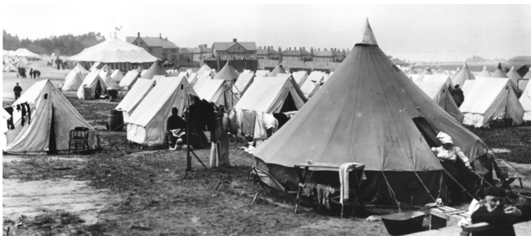
Fig 11: Refugee Camp—The homeless lived in refugee camps like this until housing could be built to shelter them.

The actions of the thousands of soldiers, sailors, policemen and firemen are familiar stories while the work of the Revenue Cutter Service has largely gone unnoticed. The Revenue Cutter Service received special thanks from President Theodore Roosevelt for their “prompt, gallant, and effective work.” The efforts to save the docks were extremely important. San Francisco flourished on its shipping and the loss of these facilities would have crippled the city. The preservation of the dock facilities allowed the city and its inhabitants to receive supplies and facilitated the rebuilding of the city. Overall, the work of the Revenue Service was integral to saving countless lives, the evacuation of hundreds of others, and preserving millions of dollars of property. The service’s accomplishments demonstrate that even a small cadre of men can make a large contribution in a crisis. The Revenue Cutter Service certainly lived up to its then unofficial Latin motto— Semper Paratus or Always Ready. 32