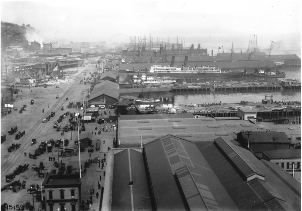
Fig 4: San Francisco Waterfront—This photo is taken from the Union Ferry Building looking towards Telegraph Hill.