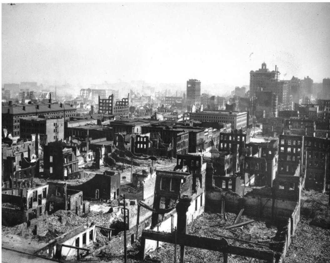
Fig 6: San Francisco Damage—The raging fire gutted most of the city and left thousands homeless.

On the 20 th , as fires still raged out of control in many parts of the city, the Golden Gate transported firemen to Black Point. The men loaded five tons of coal and then delivered it to Fisherman's Wharf to fuel the boilers of the city's fire engines. The firemen requested that they move the cutter near the foot of Mason Street. Here Dodge and his crew worked to connect the ship's pump to a disabled fire engine. Complicating this effort was the different sizes of couplings used by the federal and municipal governments. Finally finding the proper combination of fittings, the Golden Gate 's pumps provided water at ninety pounds of pressure to the fire engine three-quarters of a mile distant. This operation worked well until the fire shifted, driving the flames parallel to the waterfront. Panic erupted and people began crossing over the hose and the vehicles of retreating citizens threatened to cut the line. Dodge stationed his men at the street intersections with orders to shoot anyone attempting to drive over the hose. The fire gradually moved towards the wharf where the Golden Gate lay. Eventually the flames became so intense that they threatened the tanks there holding gas and oil. Dodge, therefore, recalled his men to the cutter and took on board refugees that had no