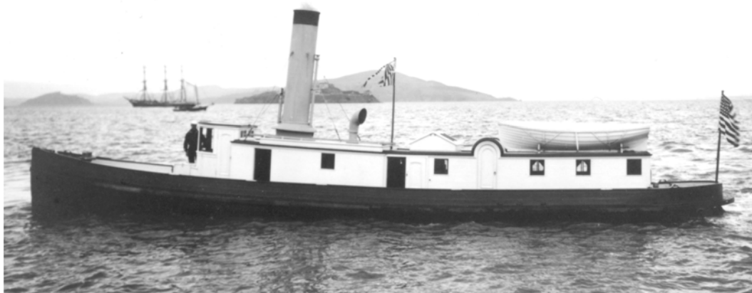
Fig 7: Hartley—The Hartley, a 64-foot cutter was commissioned in 1875 and served San Francisco as the boarding vessel for the port.

During the disaster the little harbour cutter Hartley continued her usual customs boardings in the bay. On the 20 th , however, she steamed to Fisherman's Wharf and from there it appeared that flames might consume the wooden Barge Office. This building served as the administrative offices for the revenue cutters that performed the customs boardings in the harbour. The crew of five landed and secured the records of the Hartley , the Golden Gate and other customs records and placed them on the small sixty-five ton cutter. She then took on board a few refugees and landed the records and passengers at the Howard Street Wharf. At 7:10 p.m. the Hartley steamed back towards the Barge Office and tied up to Fisherman's Wharf. The crew and a few fishermen formed a bucket brigade and worked until nearly 3:00 am to save the Barge Office and two nearby warehouses. This would be the Hartley's only efforts of assistance. During the remaining days of the emergency, she continued her duties as the customs boarding vessel for the port of San Francisco. 25