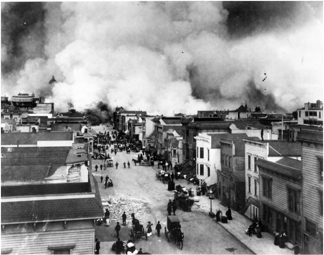
Fig 3: San Francisco on Fire—Large portions of the city survived the earthquake only to be destroyed by fires. The Revenue Cutter Service helped the citizens escape the flames, carry their possessions to safety and aided the San Francisco firefighting efforts.

With the Appraiser's Building safe, McMillan took his squad to the Fairmont Hotel, one of the initial command centres for the authorities. Here they reported to the Army's commander of the Department of California, Brigadier General Frederick Funston. Funston took charge of the city after the earthquake and ordered troops in from the surrounding military installations to help with the firefighting efforts. McMillan and his squad helped the army personnel to stow several tons of dynamite brought over to the city from the Presidio. The army and city leaders later used these explosives to destroy buildings in a desperate, but largely unsuccessful, attempt to form firebreaks. 7