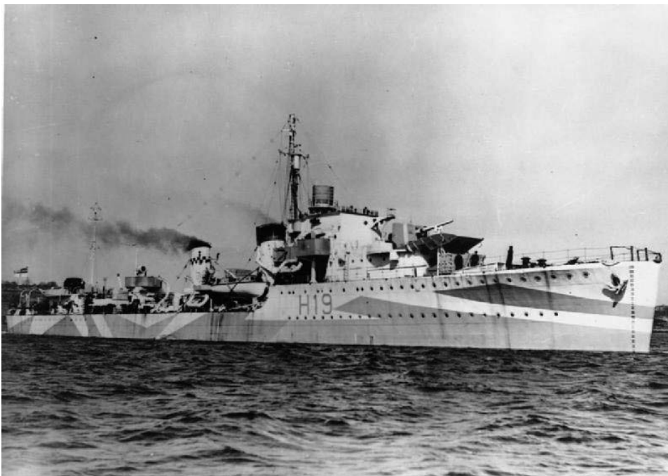
HMS Harvester

Mae West. (My Vitabuoy 7 turns out to be a very useful watch coat, as well as a good substitute for the Mae West, but in daytime I wear both – not that either would be any good in these heavy seas and present cold.