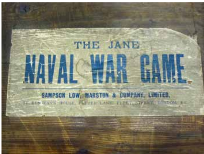
Figure 1. The Jane Naval War Game.