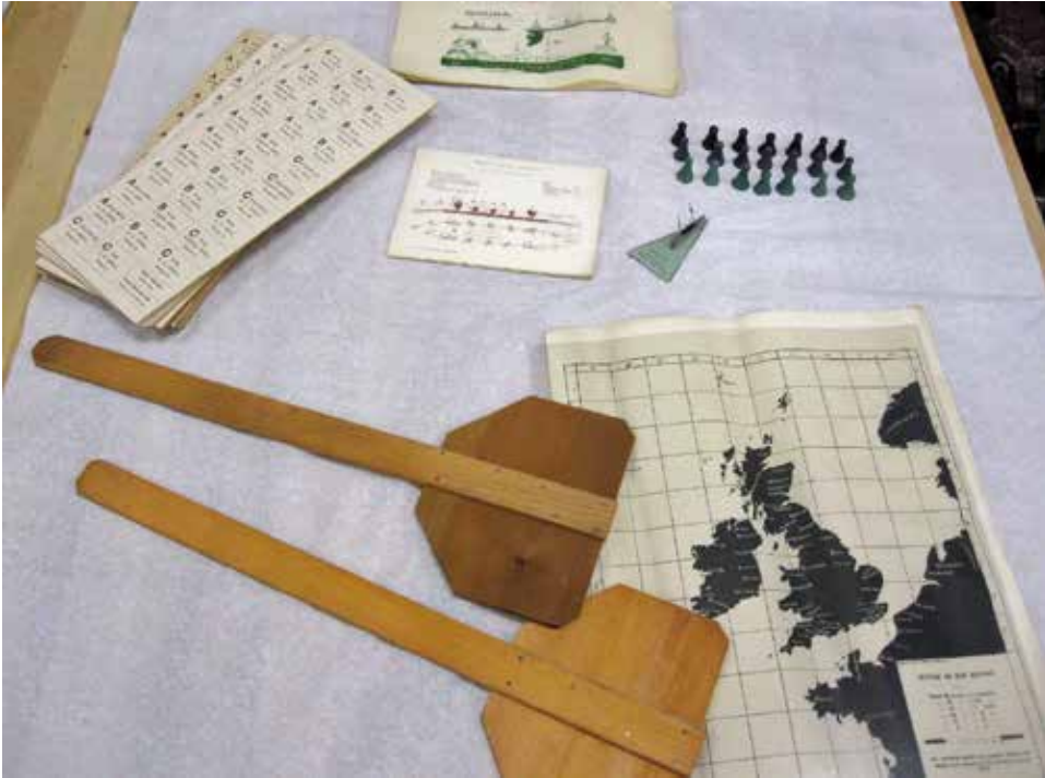
Figure 3. The materials to play the Jane Naval War Game.

1. When unfortified towns are bombarded, projectiles to the value of half the town must be expended. A 50 point town is destroyed by 25 points worth of projectiles - time, three hours; a 100 point town by 50 points of projectiles - time, five hours; a 200 point town by 100 points of projectiles - time, seven hours. If less are fired, damage to be proportionately less.