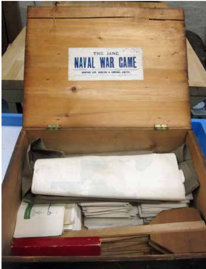
Figure 2: The open box contents of the Jane Naval War Game.

of ammunition plus the risk equals the damage done to the enemy.