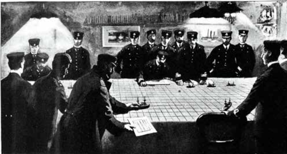
THE NEW NAVAL WAR GAME: OFFICERS PLAYING A FLEET ACTION ON H.M.S. "MAJESTIC"