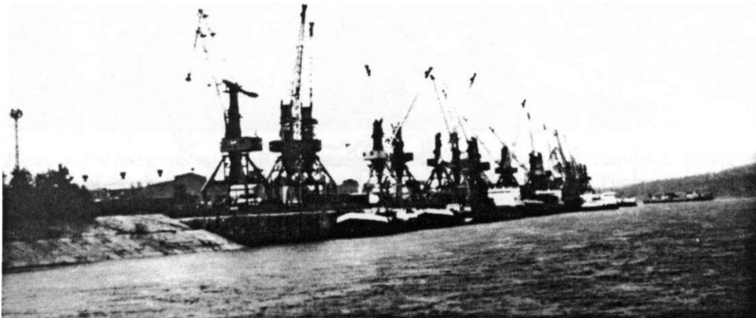
Figure 7: Rail-river interface: Osetrovo on the Lena, 2700 kilometres from the sea. The Lena functions as part of an integrated system of which the Northern Sea Route is in the northern tier.

The great Siberian rivers move supplies to the Arctic coast from railway ports in the south and transport goods brought by sea into the interior. The total freight carried on the Ob'-Irtys, Yenisey, and Lena systems (much of it between river ports) is roughly eleven times that transported on the sea route. In recent years rivers have carried sixty-five percent of waterborne freight in Siberia, and ninety-two percent of freight delivered beyond the Arctic circle. 42