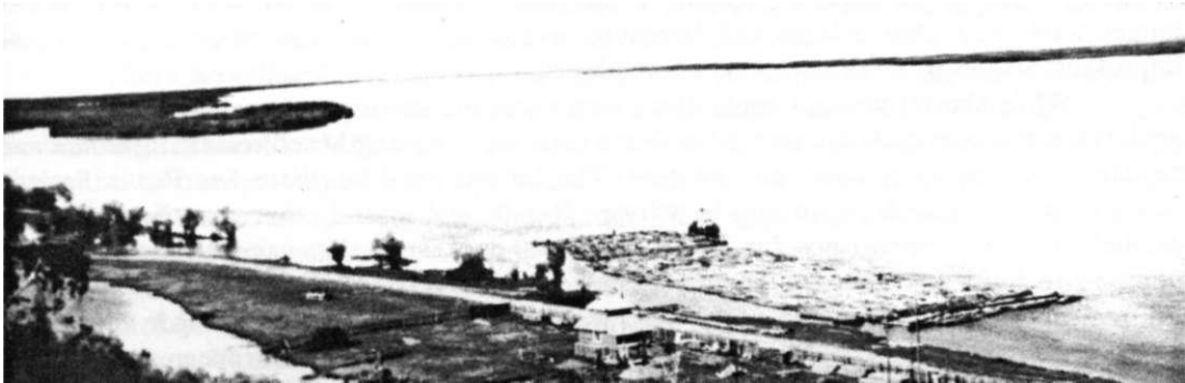
Figure 9: Moving raw materials by water: timber raft on the Lena near Yakutsk in 1989. Note the width of the river in this location, some 1400 kilometres from the sea. Timber floated down the Lena is loaded for Japan at Tiksi near the river mouth.