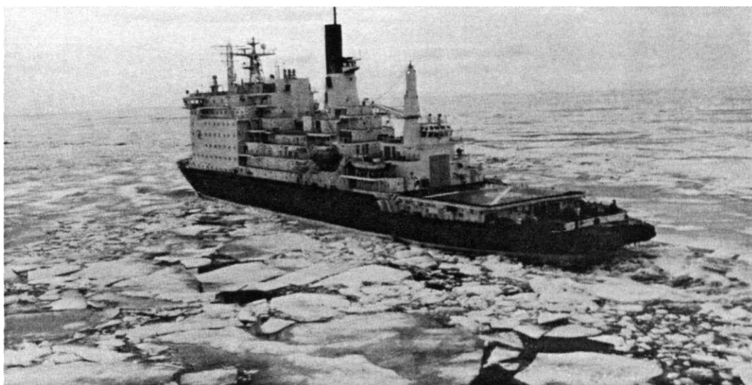
Figure 6: Nuclear-powered icebreaker Vaygach on the Northern Sea Route, September 1991. This is one of two 44,000-shp vessels built in Helsinki and fitted with nuclear reactors in Leningrad. Termed "shallow draught" icebreakers, they draw 8.1 metres, which makes them suited for working in river estuaries.