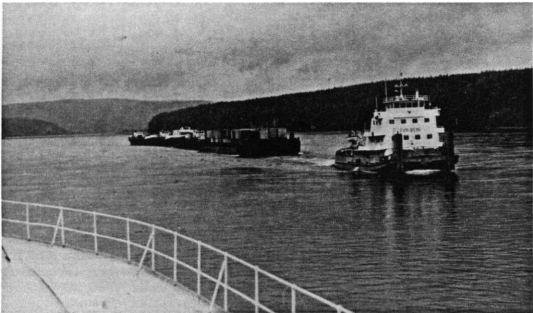
Figure 5: North-south arteries connect the Northern Sea Route with the interior: tug and barges on the Lena, 1989. Note the containers on the first barge.