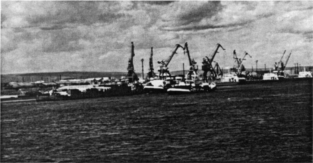
Figure 4: Riverine infrastructure: Lonsk (Yakutia) on the Lena River, 1989. The vessels alongside on the right are similar to the versatile "river-sea" type introduced some twenty years ago. They have traded all over Russia and have voyaged to the UK and the Mediterranean.