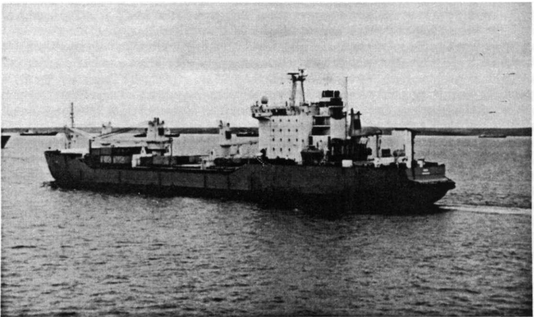
Figure 3: SA-15 type icebreaking ship Kola in Pevek roadstead, September 1991. These versatile double-hull ships can handle ro-ro, container and bulk cargoes. (Ro-ro stern ramp visible on starboard quarter above stern towing notch for taking other ships in tow in ice.) They have an icebreaker bow, thirty-six millimetre icebelt plating, and an air bubble system below the light-load line.

The SA-15s, with 21,000 shaft horsepower (shp), have been described as "quasi-icebreakers" and are capable of forcing their way through ice one metre thick. 36 Another innovation was the use of lighter-carrying freighters ("LASH," or "lighter aboard ship vessels"). The lighters can enter shallow waters and eliminate the need for large harbour facilities. An icebreaking LASH carrier traded to the eastern Arctic starting in 1987, and a 40,000-shp, nuclear-powered, ice-strengthened LASH ship, Sevmorput , was introduced in 1989. By 1990 thirty percent of the cargoes delivered to Tiksi and Mys Schmidta were carried in LASH ships. However, there have apparently been difficulties in loading and unloading lighters on open and exposed roadsteads and it is reported that Sevmorput has not been cost-effective. 37