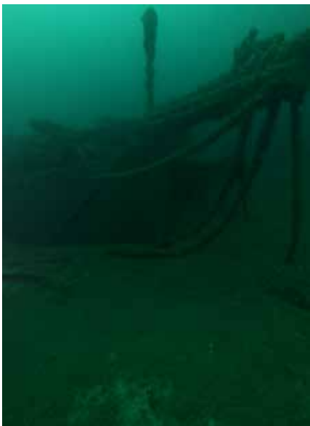
Figure 4 The Starboard bow