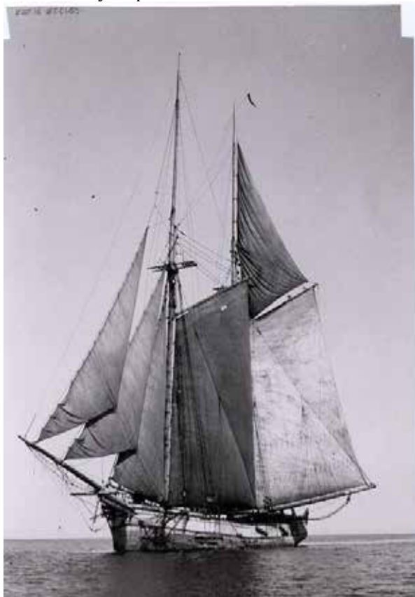
Figure 2 Katie Eccles