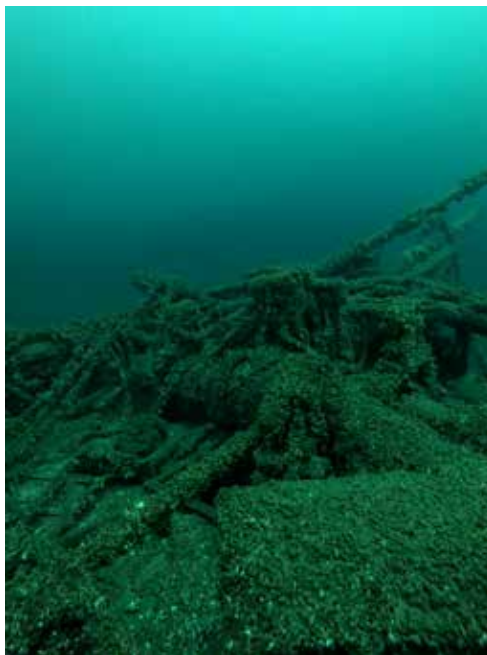
Figure 6 The foredeck, windlass and forecabin companionway hatch.

The inner post, sternpost, and rudder remain standing at the stern, with the disarticulated steering gear hanging from the forward face of the wheel box from the head of the rudder post. The iron wheel consists of an eight-spoke design and is attached to a worm-simplex type steering gear with the worm mounted forward of the head of the rudder which hangs down along the aft side of the rudder post. Other notable site features include a large spar, tentatively identified as the main gaff, in the debris field off the port quarter and a single straight-stock admiralty anchor approximately ten metres off the starboard side amidships.