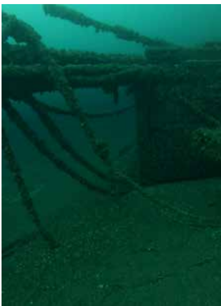
Figure 5 The rigging of the bowsprit

attachment of wire shrouds around the hounds of the masts has resulted in a considerable quantity of wire rigging covering the foredeck and draped over the port rail between the cathead and port fore chains.