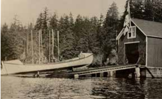
Ucluelet Life Saving Station circa 1935.

across the country) operated with a paid coxswain and a semi-volunteer crew who were paid for practices and call-outs, albeit not very much, the crew receiving “40 cents an hour for periodic drills (and) if called out on life-saving service, the crew to receive $2.50 per day with subsistence and double pay while actually engaged in life-saving.” Given these rather parsimonious rewards, plus the very real chance of dying (as an example of the dangers, seaman Thorald Wingen, of the Ucluelet life-boat was knocked unconscious and drowned during a capsized on 16 February 1912) it was not surprising that efforts to keep a crew were practically hopeless.