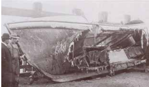
The wreck of Bamfield's motized lifeboat, Jan. 1909

Again, given the limitations of the pulling boats, the idea was that a second MLB, then under construction in Vancouver (along with another MLB to replace the one at Bamfield that had been wrecked only one year after being placed in service) would be stationed at this strategic location,